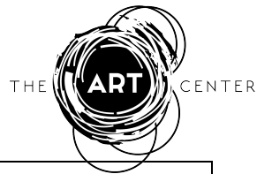
Exhibit Dates: November 22, 2024 - January 4, 2025