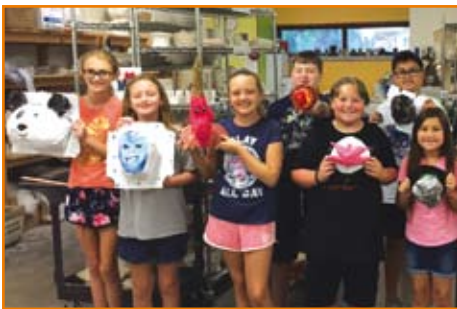
4th- 8th grade Sculpture Spree class