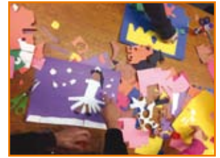
smART Kids creating Picasso inspired paper collage